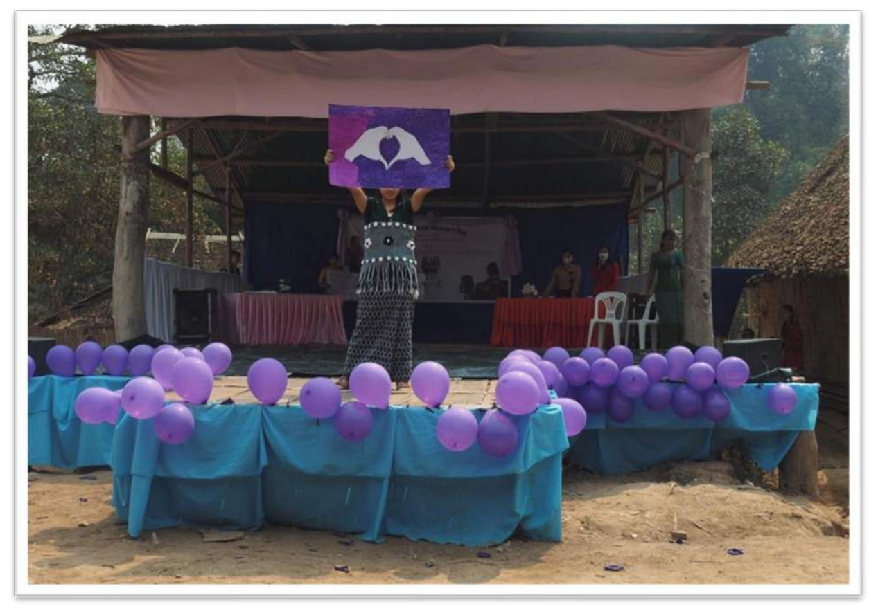
The Fashion Show begins with this year's sign: the hand heart gesture <3