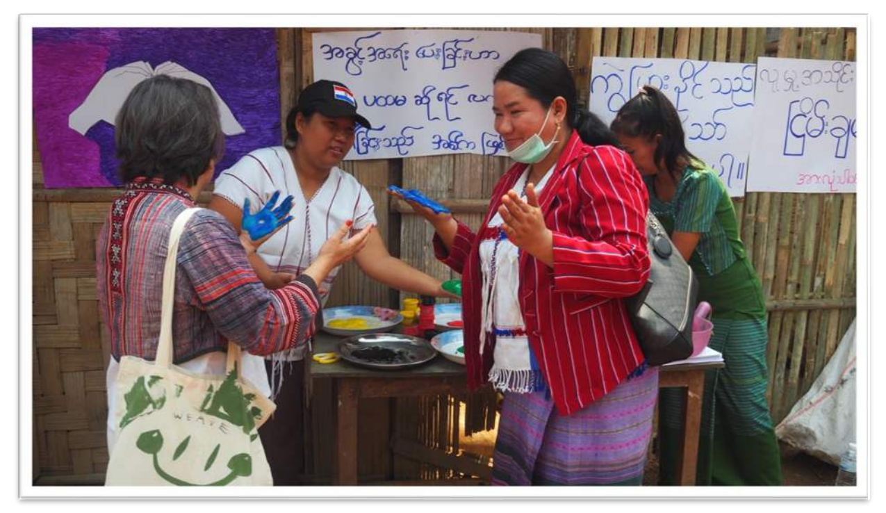
Colorful hands to commit to gender equality & women's rights