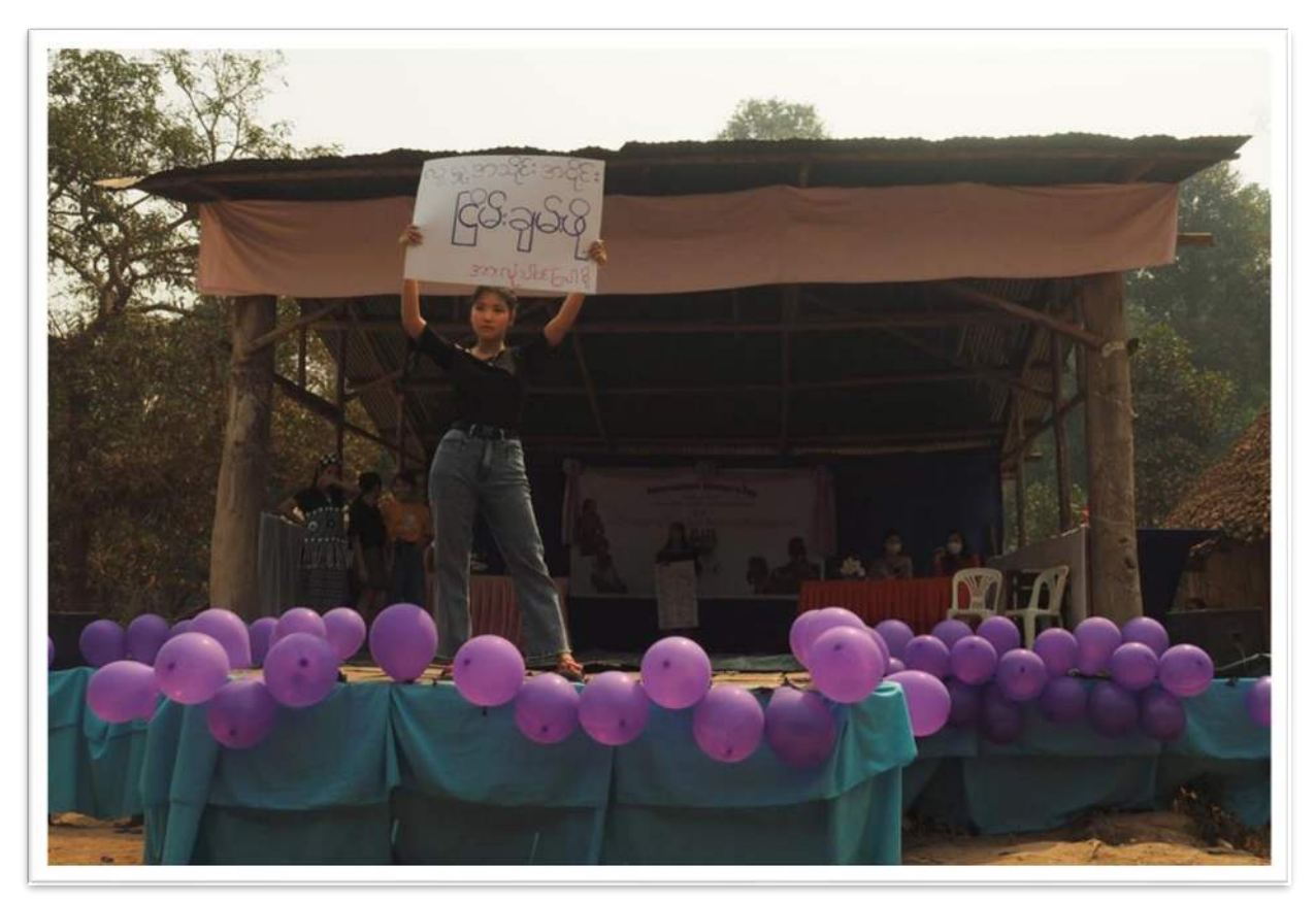
Girls running the catwalk holding banners with messages calling for economic, political & social equality