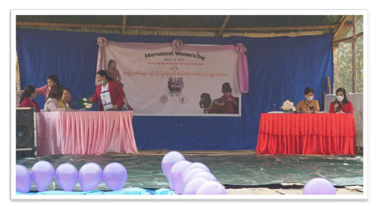
Decorated stage with hosts on the right