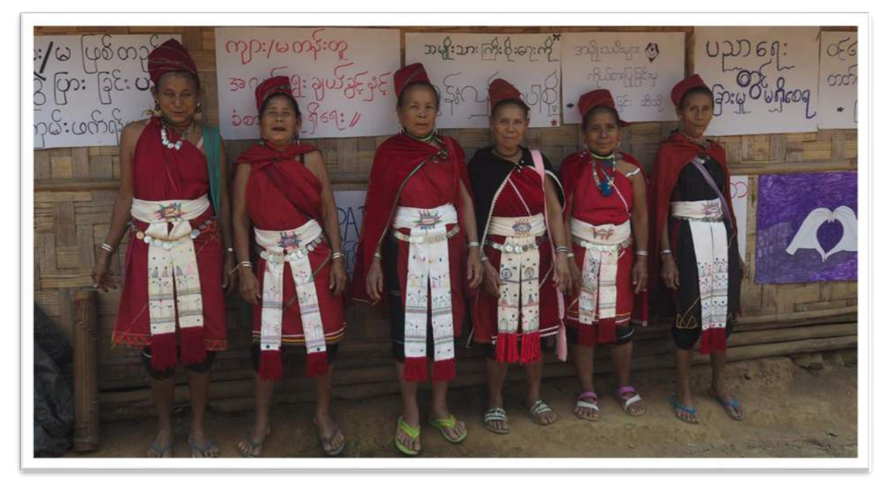
Traditional Kayah outfits